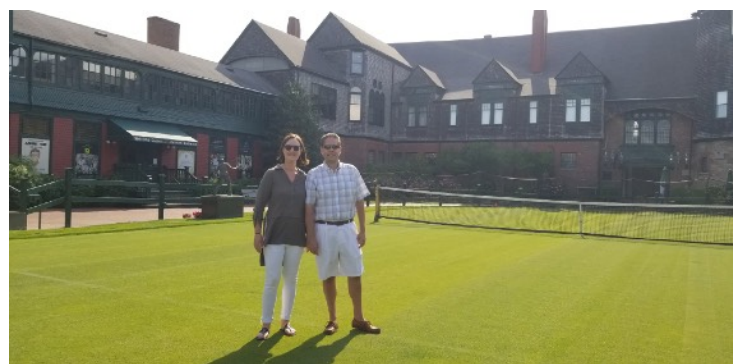
International Tennis Hall of Fame